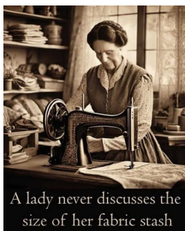
A lady never discusses the size of her fabric stash