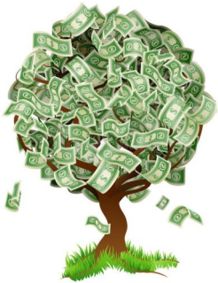
February 2025 Income Statement